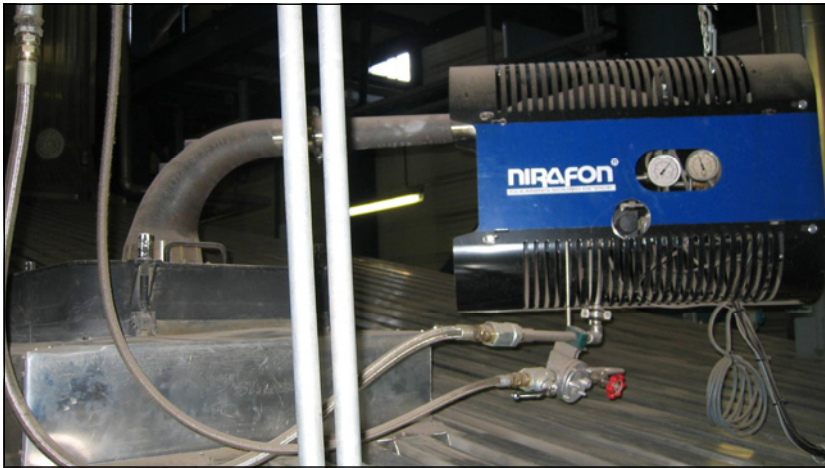
The third Nirafon CSD Gas Pulse Cleaner installed on top of the economizer